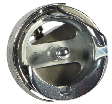
Figure 1 - Hook & Basket